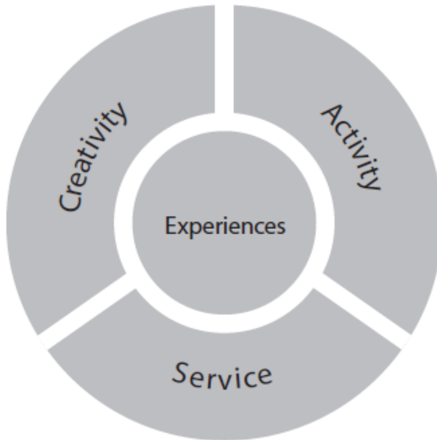
Figure 2 CAS experiences

A CAS experience is a specific event in which the student engages with one or more of the three CAS strands.